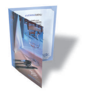
Menu Covers 250 from €403.20 MECAS?