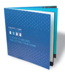
Large Square 210x210mm pages