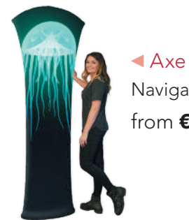
Navigation stand from €312 FDSTKOFC