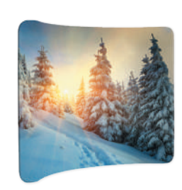
3.0m wide curved stand from €518 EDSROOFC