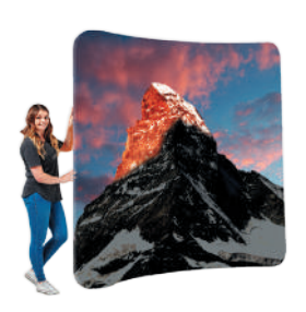
Curve 24 2.4m wide curved stand from €440 FDSRIDEC

Stage 30 from €559 FDSNYOFC Rialto Bridge from €559 FDSHAMFC