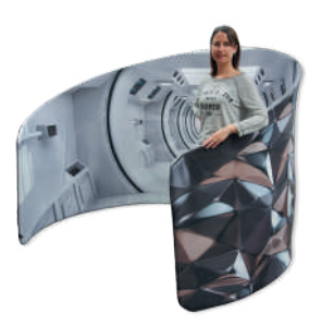
Snuggle Small C-shaped booth from €1063 FDSWELFG