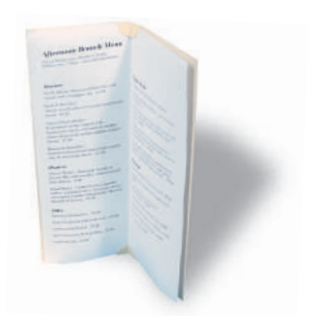
Menu Grips 250 from €477.90