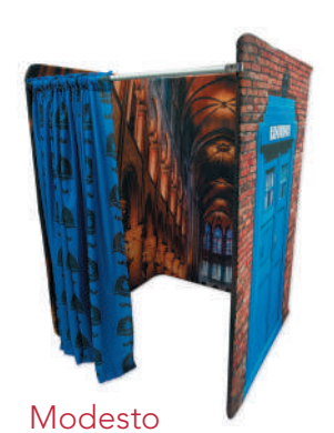
Cubicle with curtain from €971 FDSVATEC