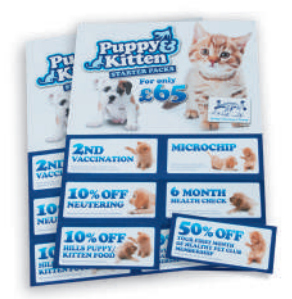
Laser Voucher Sheets 250 from €122.40