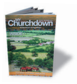
Portrait A5 148x210mm pages