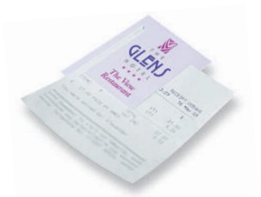
Receipt Clips 250 from €97.20