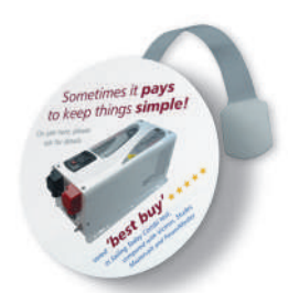
Wobblers 500 from €276.30