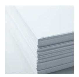
Power User Stationery

120gsm Stonemarque texture. 250 from €85.50 stonessio