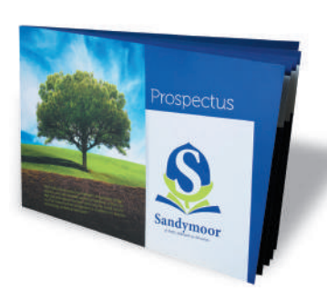
Landscape A4 297x210mm pages