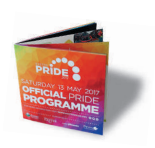
Small Square 148x148mm pages