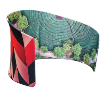
Embrace C Large C-shaped booth from €1328 FDSPREFC