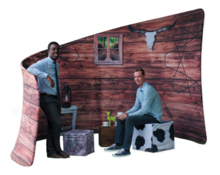
Huddle Sloped meeting booth from €1328 FDSBEIFC